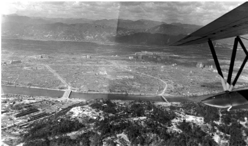
Ruins of the Hiroshima Delta viewed from above Hijiyama Hill, looking west. On the right is Tsurumi-bashi Bridge, and on the left is Hijiyama-bashi Bridge, both spanning the Kyobashi-gawa River.